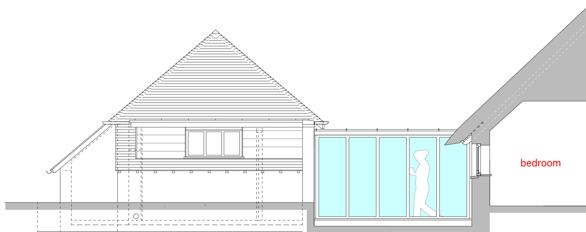
proposed cross section C - C